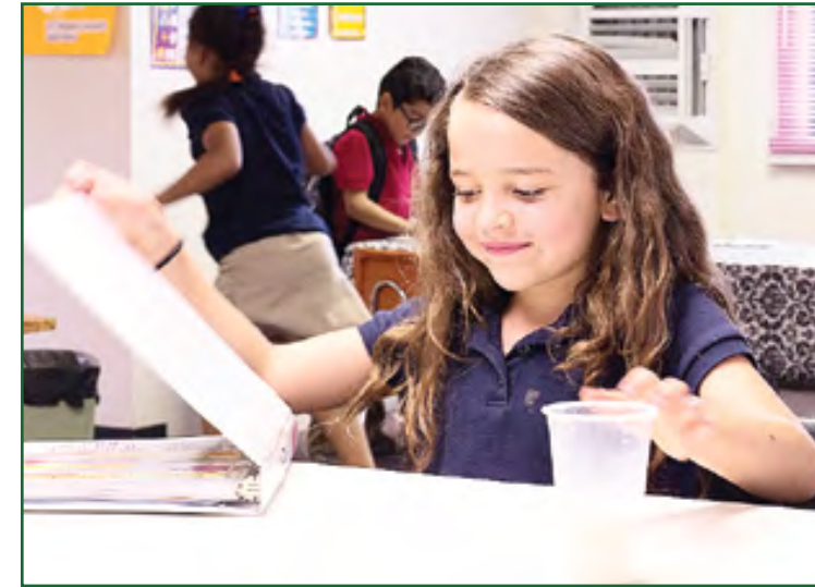
An ASC student enjoys a snack and help with homework.