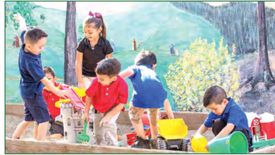
Preschoolers enjoying playing in the sand box on the preschool playground.