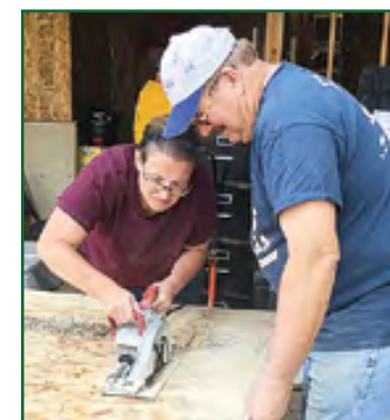
McCurdy volunteers work on a carpentry project.

The number one time that children get in trouble with drugs, sex, alcohol and the law is 3 to 5 PM so fun, educational faith based After School Care is critical to the safety of our students. McCurdy Ministries cares for 19 preschool to 6th grade students every school day through this faith based program. At After School Care students experience free play, snacks, homework help and educational games as well as faith building art, crafts, drama and Bible study. A small tuition is charged to help support the program but families that qualify for Free or Reduced Lunch are eligible for financial aid. We look forward to expanding this program to the whole community next fall. We are grateful to the donors and volunteers that support After School Care and help keep our students safe while having fun, learning and sharing the faith.