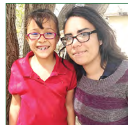
A Project Cariño Big Buddy and Little Buddy enjoy time together.

In the United States, educators have been stressing the critical importance of early childhood education. Research shows that children who attend preschool and therefore have an early childhood educational intervention in their lives, are far more likely to graduate from high school. Unfortunately, there are only classroom spots for 39% of the preschoolers in Española so keeping McCurdy’s Preschool Program strong is critical. For the 2017–18 school year we are continuing our free morning NM PreK and low cost faith based afternoon preschool. As soon as the state allows, during the 2018–19 school year we plan to expand to an all day, free four year old NM PreK. Then the following year, once building improvements have been made to the Children’s Ministries Center we plan to expand to two, all day four year old preschool classes. We are grateful for an excellent, dedicated and faithful preschool staff who do an excellent job of preparing our students for kindergarten. It is not unusual for our teachers to get thank you letters from parents after their children have started kindergarten noting that their child is better prepared for school than most. Most of all we thank the New Mexico Children Youth and Family Department and the many individual donors who support our early childhood programs.