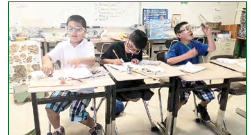
Three Camp Stars students learn about geology.

The “summer slide” is the well documented loss of learning that occurs over the summer break if a student doesn’t participate in a summer learning program. Camp Stars which was created to combat the “summer slide,” is our six week, 35 hours per week, summer educational enrichment camp which includes STEM education (science, technology, engineering and math) learning and faith sharing through Vacation Bible School fun and service. This year 31 campers from kindergarten to 6th grade participated in this camp which includes science experiments, math exercises, field trips, service projects, art, drama, crafts and singing all while learning more about God, Jesus and our Christian faith. We thank the Montei Foundation for being the major donor to Camp Stars for the fifth summer. They make this camp possible. We also thank the Rio Arriba County Summer Food Program for providing breakfast and lunch for our Camp Stars participants.