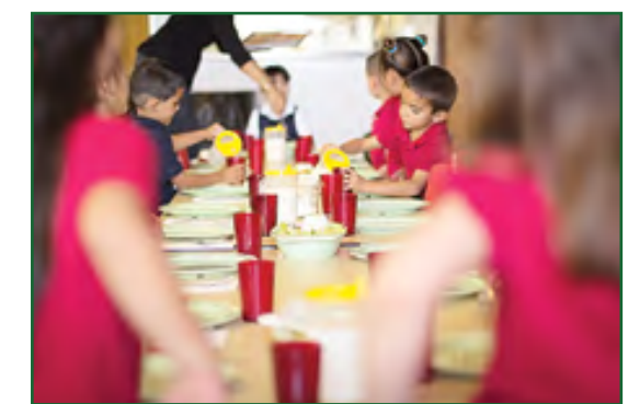
MMCC preschoolers enjoy a family style lunch together with their teachers every school day.

McCurdy Ministries is the vendor for the McCurdy Charter School Breakfast and Lunch Program and we also feed our preschoolers every school day. Although the majority of meal cost is reimbursed by USDA, McCurdy Ministries financially supports this program because federal reimbursements are not enough to feed our children the healthiest of meals. For the 2016–17 school year we fed 5,356 breakfasts and 60,636 lunches to our preschool and K–12 students. Research shows that hungry children don’t learn and many of our children don’t get regular meals at home because they live in poverty, so we know this aspect of our ministry is critical. More importantly our breakfast and lunch program reflects the importance of Jesus’ command to, “Feed my sheep.” We thank the donors that help make sure there are not hungry students on our campus.